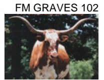
FM GRAVES 102