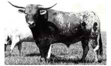
TEXAS TORO 60