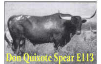
DON QUIXOTE SPEAR E 113