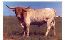
TEXAS RANGER JP