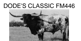
Ace's Belle Star