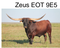
Zeus EOT 9E5