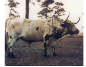
Miss Dayton #5